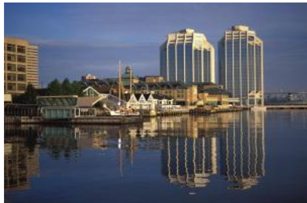
Halifax Harbour